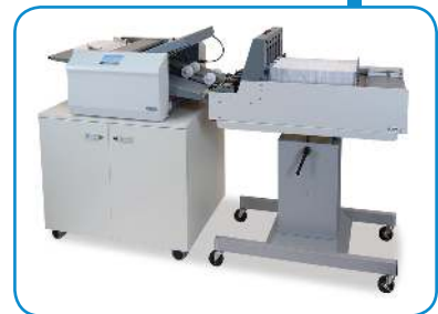
FD 2056 in-line with optional V-Stack36i Vertical Stacker, stand and cabinet

Formax - New Hampshire, USA www.formax.com