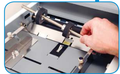
Removable Feed Wheels