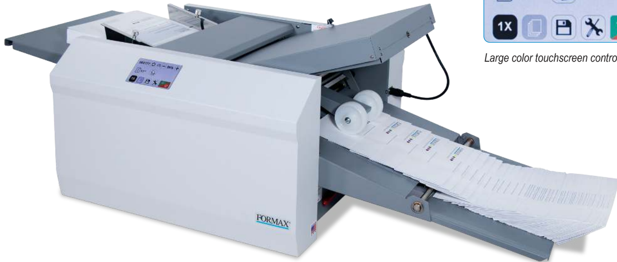
Large color touchscreen control panel

The AutoSeal ® FD 2056 is a fully automatic pressure sealer which provides the ultimate high-volume tabletop solution for processing pressure sensitive one-piece mailers. Designed with ease of operation and efficiency in mind, the FD 2056 features a full-color touchscreen control panel, and automatically detects and adjusts for 11", 14" and 17" forms. It offers 5 pre-programmed standard folds for even panel C, V, Z and uneven/eccentric C and Z folds. It also has the ability to store up to 35 custom fold settings with the simple touch of a button.