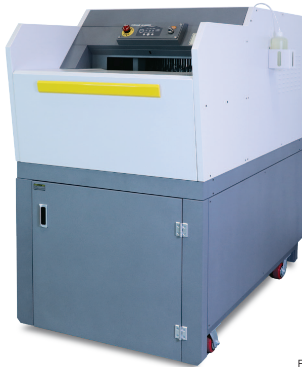
FD 8906B Industrial Shredder