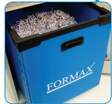
Lifetime Guaranteed Heavy-Duty Waste Bin