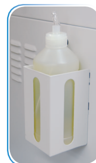
EvenFlow™ Automatic Internal Oiling System

*Capacity varies depending on paper and power supply