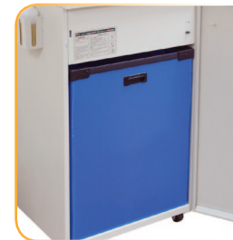
Heavy Duty Waste Bin