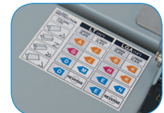
Clearly marked fold guide for quick and easy setup